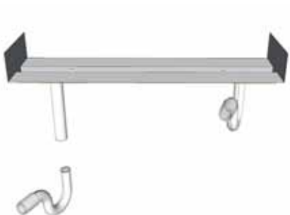
Horizontal 10 cm flange

Rear, front, left or right, custom-fabricated