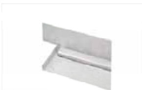
2 cm wall flange for frameless glass shower screen