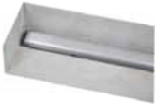
10 cm wall flange

Custom-fabricated 10 cm wall flanges for wall mounting and horizontal flanges for safe and easy sealing, easy pouring of floor screed with slope in one direction, easy installation of large format tiles on the floor